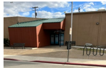
RV - Riverview 392.2020 401 Willow Dr