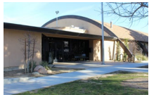
GA - Greenacres 392.2010 2014 Calloway Dr